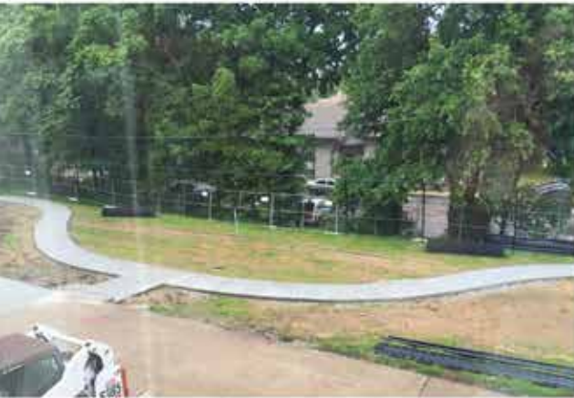
Photo and artist's rendering: A walking path, soon to be surrounded by flowers, trees and raised beds, winds through the Women's Center garden.