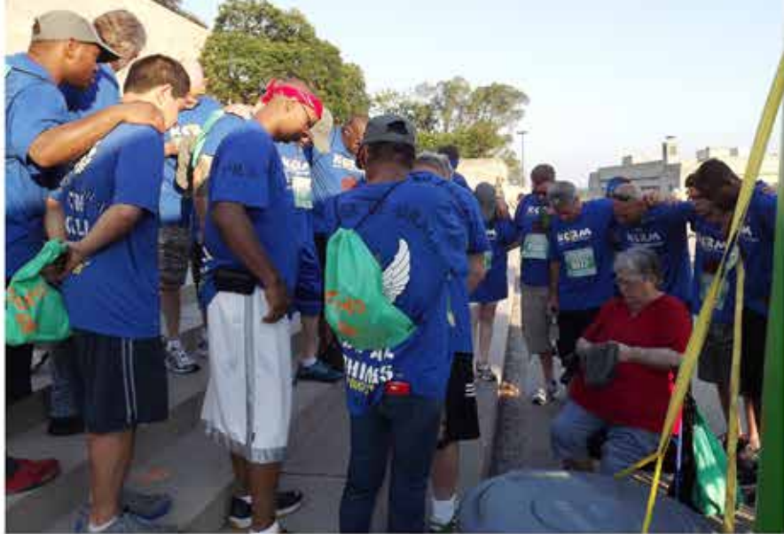
Christian Community of Recovery residents, along with those who came to cheer them on, gather to pray before they begin their 5K run together.

A frustrated staff member at the Mission asked the other day, “Can someone please explain the cloud?!”