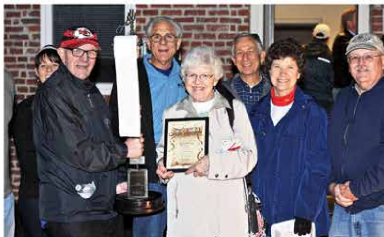
Kansas City First Church of the Nazarene wins the coveted TP Trophy for 2014.

Please note: The KCRM Works in Progress Art Show scheduled for First Fridays, September 4, has been postponed until further notice.