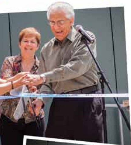
g of Center r left) RM